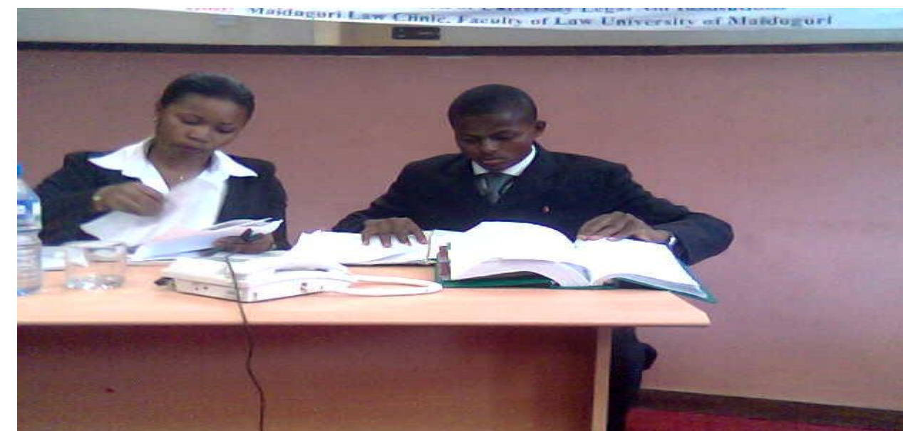
Clinicians in a client interview & counselling session