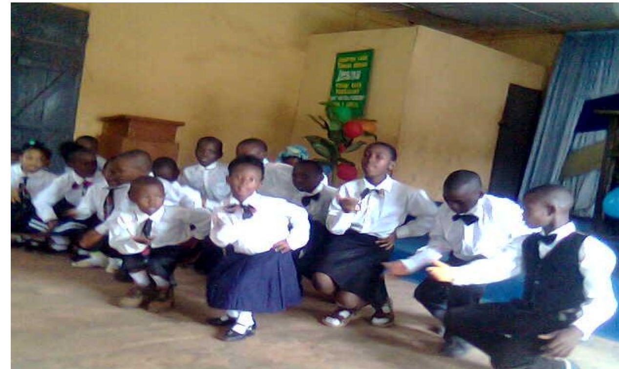
Pupil performing in EBSU Law Clinic street law programme on rights of children under the Child Rights Act 1995