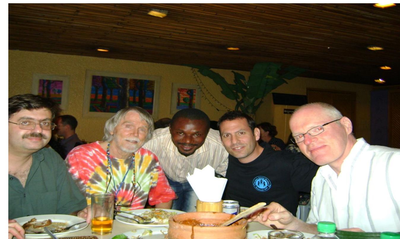
Clinical professors in a clinical legal education in a community context in Manila

Law Clinic- a law office in a law school!